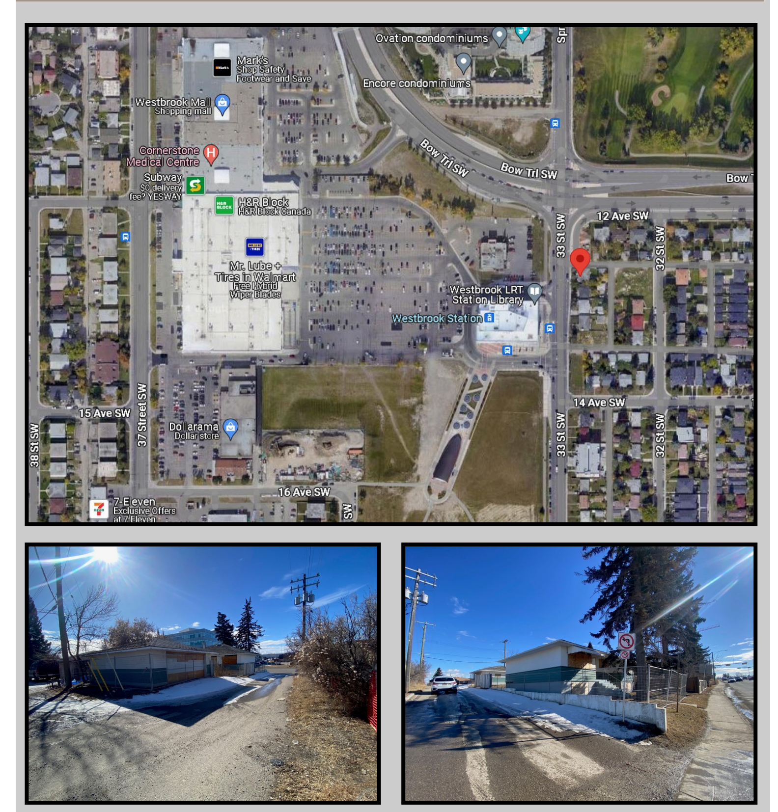
NOTE: Information contained herein is compiled from sources deemed to be reliable, but is not warranted to be so. All information is subject to verification by the purchaser and does not form part of any future agreement. This property may be withdrawn from the market at any time with not notice.