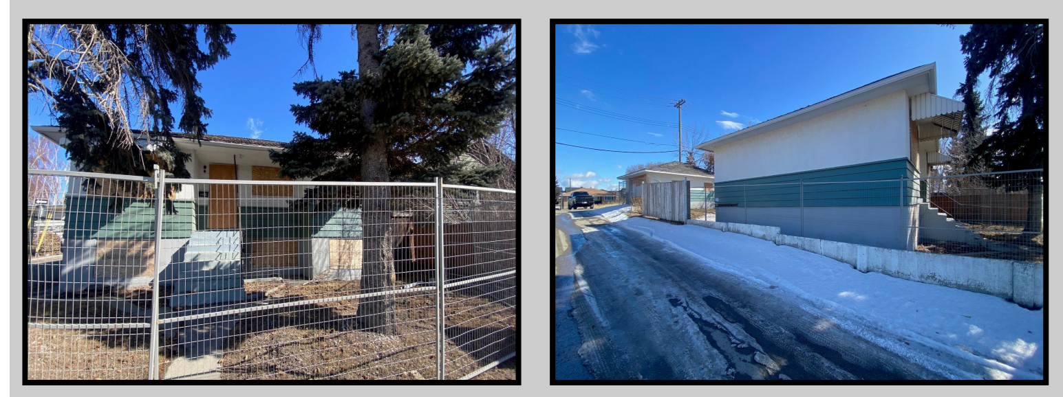
NOTE: Information contained herein is compiled from sources deemed to be reliable, but is not warranted to be so. All information is subject to verification by the purchaser and does not form part of any future agreement. This property may be withdrawn from the market at any time with not notice.